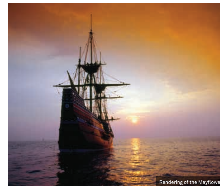
Rendering of the Mayflower