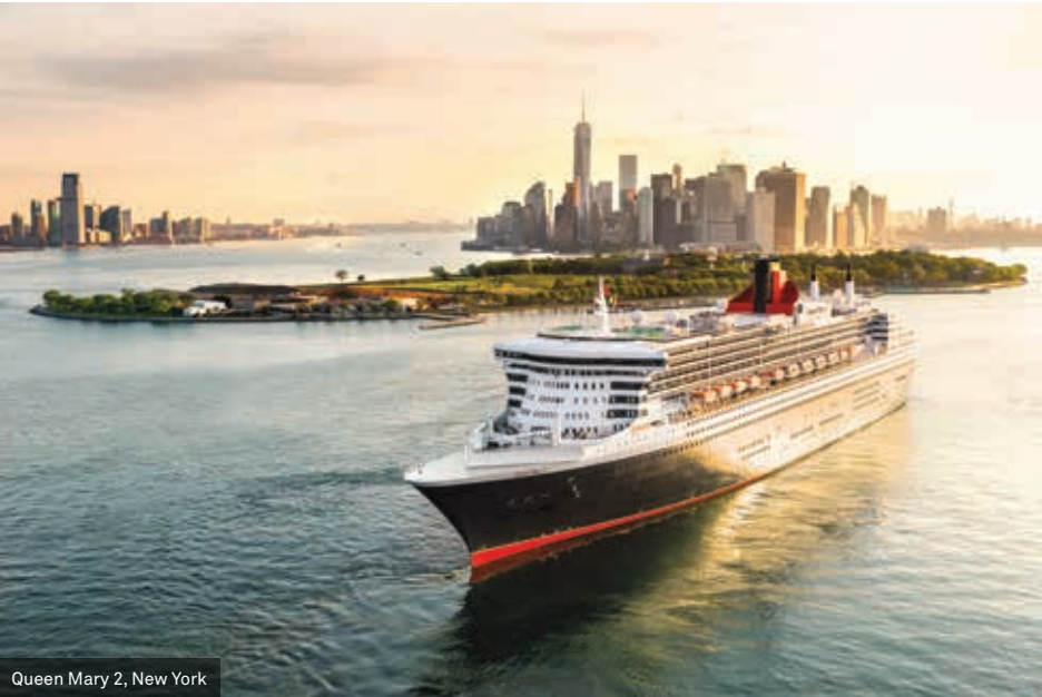
Queen Mary 2, New York

Q020 Ports of call: Vancouver , British Columbia > San Francisco (overnight) > Astoria > Victoria, British Columbia (late night) > Vancouver , British Columbia