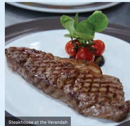
Steakhouse at the Verandah