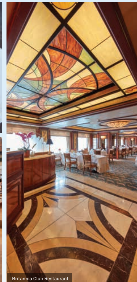
Britannia Club Restaurant