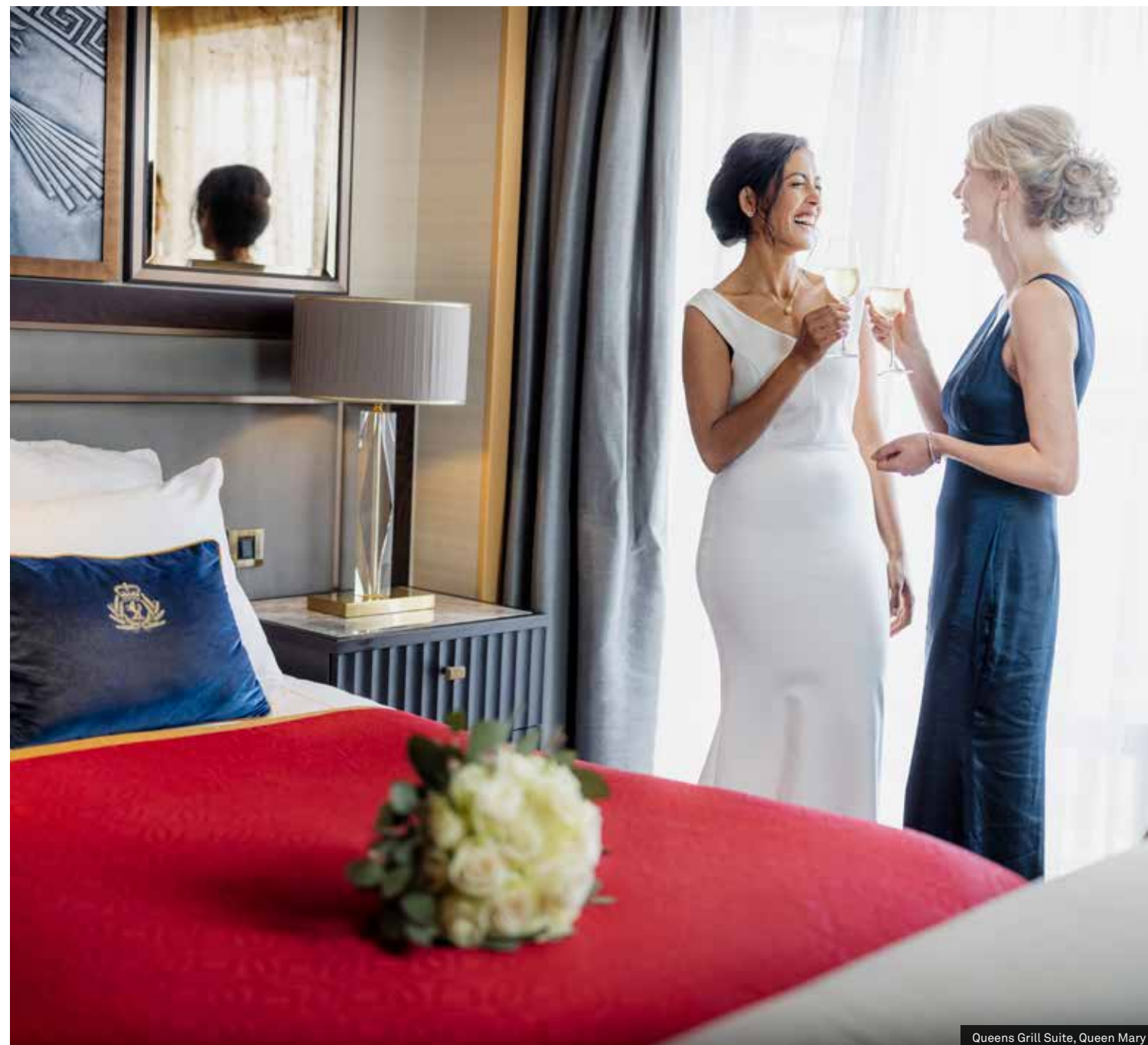
Queens Grill Suite, Queen Mary 2

Cunard offers some of the most spacious staterooms and suites at sea, so whichever ship you wish to celebrate your special day on, your well-appointed Britannia or Britannia Club stateroom or refined Queens Grill or Princess Grill Suite will include thoughtful details to ensure you feel at home.