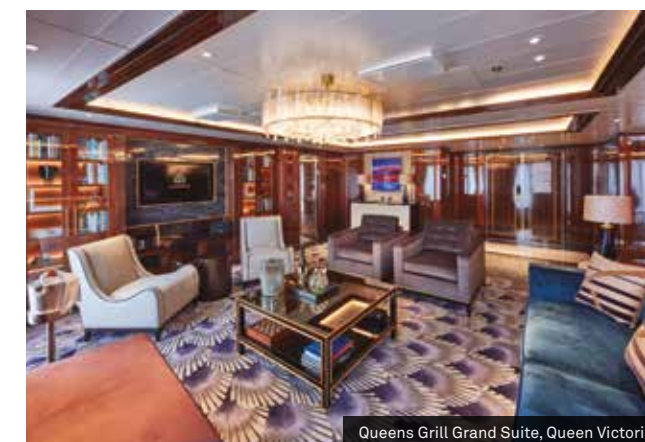
Queens Grill Grand Suite, Queen Victoria