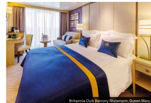
Britannia Club Balcony Stateroom, Queen Mary 2