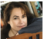
Amy Bloom, July 6, 2009 Eastbound Crossing Author of the well received novel, Away , and contributor to a variety of periodicals, including The New Yorker