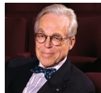
John Guare, September 8, 2009 Eastbound Crossing American playwright best known for such popular works as Six Degrees of Separation