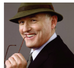
Christopher Buckley, November 5, 2009 Eastbound Crossing Author of 14 books, including The White House Mess and Thank You For Smoking

Cunard Insights enrichment programme — the best of its kind at sea — features a wide variety of illuminating lectures, workshops and courses on select voyages. Be among the first to enjoy our exciting new programme, Literature and Liners , available only on the most storied voyage of them all — the Transatlantic Crossing with Cunard. ®