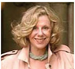
Erica Jong, June 13, 2009 Westbound Crossing Author, poet and teacher, best known for her novels Fear of Flying and Fear of Fifty